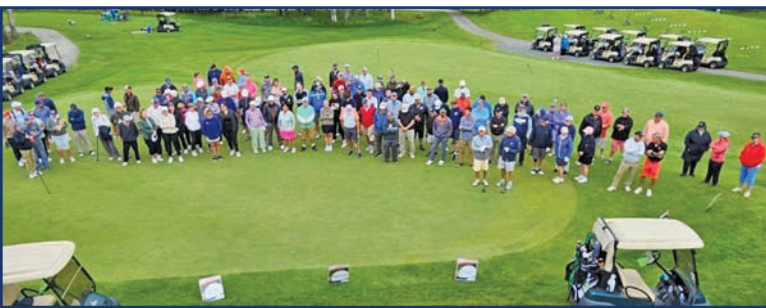
2024 Tee It Up for Health at Haystack Golf Club

REGISTRATION: $175 per golfer / $700 per team includes greens fees, several contests, cart, golf balls, box lunch, snacks, logo gift, and awards dinner. 32 teams joined us last year.