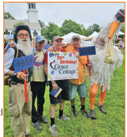
These "babies" were delivered at Grace Cottage a few years back!