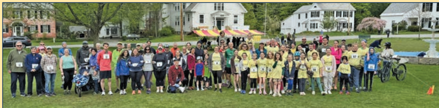
Many of the 5k participants assembled for a photo before the event.