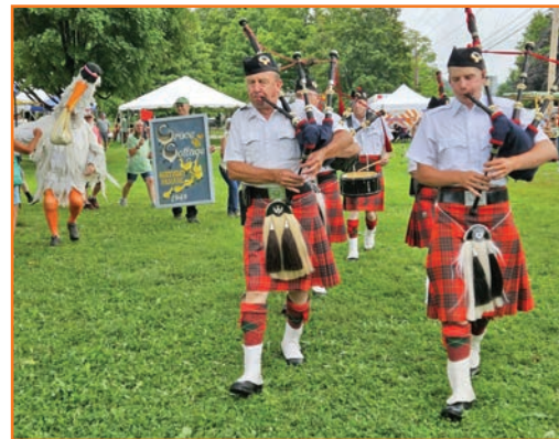
Bagpipers and the stork led the Baby Parade.

seeing you on the Townshend Common on Saturday, August 2, 2025, for the 75th Annual Hospital Fair Day!