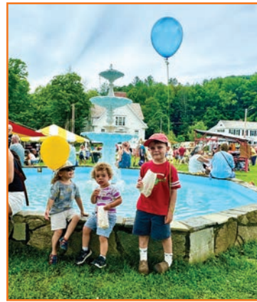
Popcorn, balloons, and a fountain, what could be better?

"The 74th Annual Hospital Fair Day was my first, and my family and I were so incredibly impressed by the dedication and hard work that goes into it, and by the overwhelming feeling of community support and camaraderie generated by volunteers and fairgoers. The spirit of caring for Grace Cottage, the hospital that cares for so many people who were volunteering in the booths and who were patronizing the Fair, was palpable."