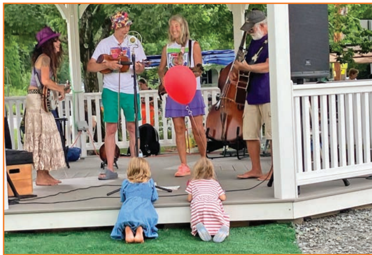
Band "groupies" at the Gazebo!

As we fondly recollect that wonderful day, where to begin? It all started with people and businesses in the community who donated books, art, jewelry, toys, knickknacks, gift certificates, household items, canoes, kayaks, pies, corn, antiques, etc. Then there were the people who sorted and/or prepared all of these items (starting, in some cases, as early as May). Volunteers came out of the hills, during the week prior to the Fair, to organize, set up booths, and sort, sort, sort. The day before the Fair, more volunteers showed up to help transport items to the Common.