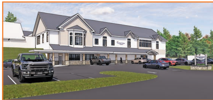
Architect's rendering of the new Grace Cottage Family Health building.

Thanks to extensive feedback from employees who work in the clinic, space and flow needs were identified and incorporated into the interior architectural plans, which are now complete, along with the exterior design for the new 23,000 sq-ft. building.