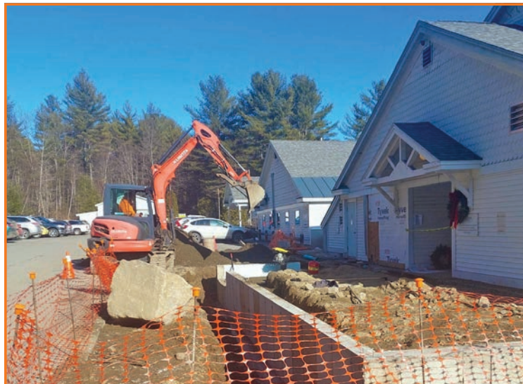
The Emergency Department remains open during construction.

Grace Cottage's Emergency Department will continue to be open 24/7, but we're excited that construction on the much-needed 17' x 42' expansion began during the first week of January! The temporary ED entrance is now located in the Nessel Pavilion; signage for parking and the new entrance has been erected for the convenience of all patients. We hope that the construction process will proceed without a hitch, and we'll be cutting the ribbon on a newly-expanded Emergency Department in May.