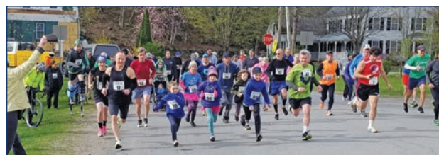
2022 Spring Into Health Starting Line