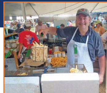
Hospital Fair Day Food Booth Frymaster