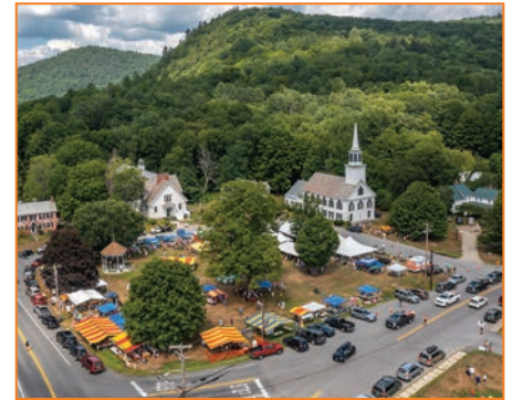
2022 Fair Day