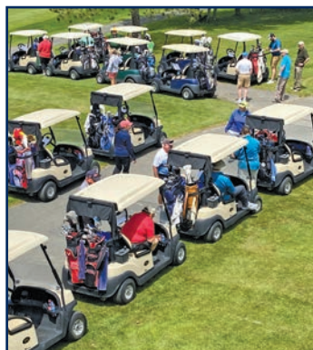
Golfers assemble with their carts for the tournament.

The weather was beautiful, the course was in excellent condition, golfers had a great time, and over $50,000 was raised, thanks to golfers, generous sponsors, and volunteers. Net proceeds from the event will benefit the Grace Cottage Family Health & Hospital's Emergency Department expansion project.