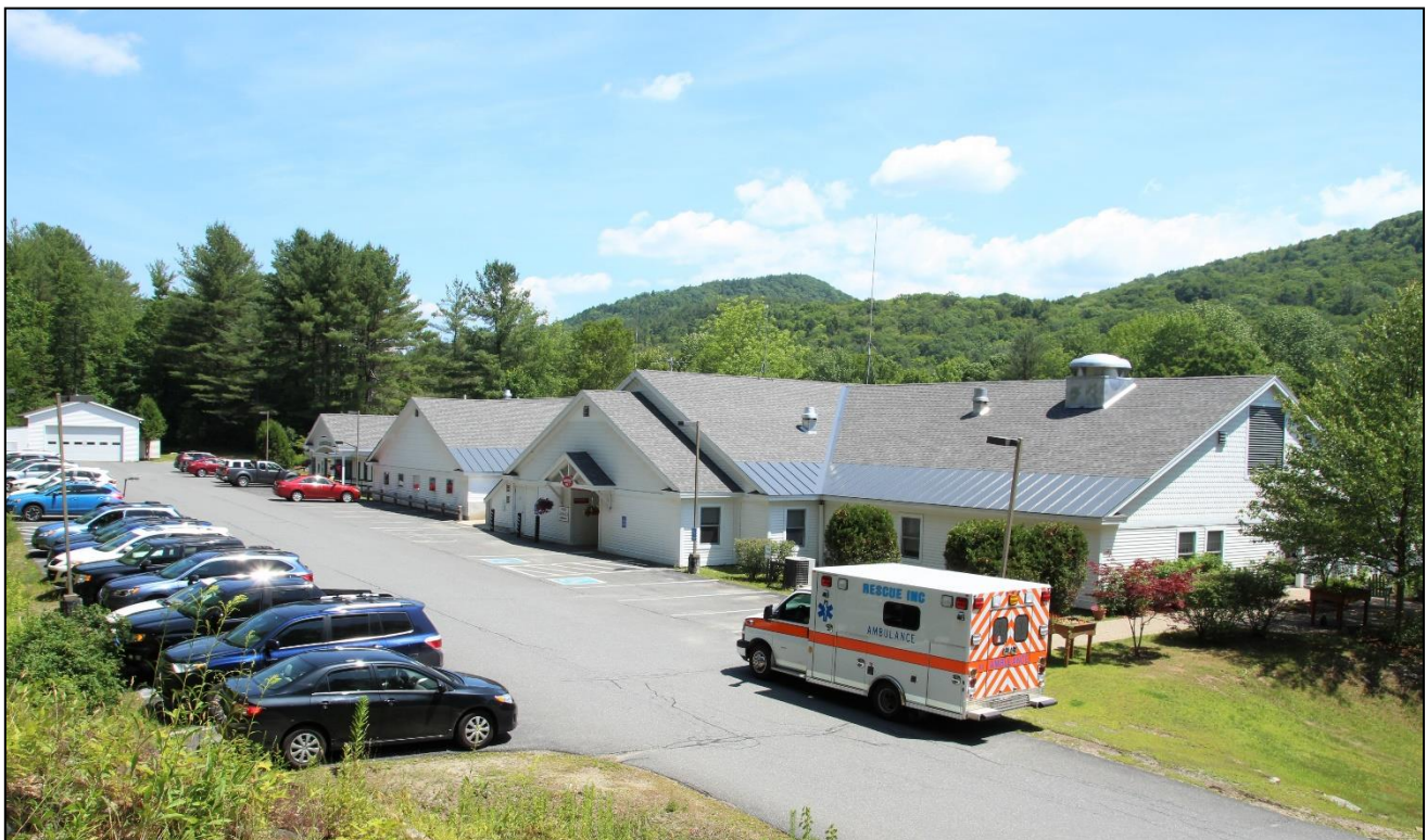
Grace Cottage Family Health & Hospital, Townshend, VT

In 2017 and in 2018, Grace Cottage was recognized as a Top 20 Critical Access Hospital in the USA for Patient Satisfaction by the National Rural Health Association. In 2021, Grace Cottage was certified as an "Age-Friendly Health System" by the Institute for Healthcare Improvement for its excellence in caring for older patients. It has won "Best Hospital" honors in the Brattleboro Reformer Readers' Choice awards for the past five years.