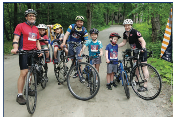
Two of the families who joined us for this year's Tour de Grace, from South Newfane, VT

Special thanks go to our many wonderful volunteers and Tour de Grace Sponsors: Cota & Cota, D&K Jamaica Grocery, Equipe Sport, Howard Printing, People's United Bank, Solstice at Stratton, Stratton Resort, and Three Mountain Inn.