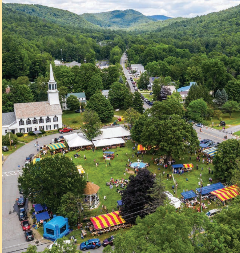
2019 Hospital Fair Day