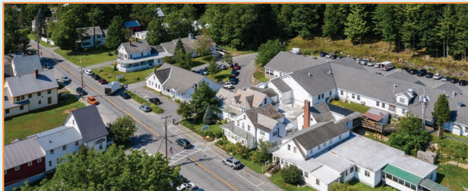
A bird's eye view of the Grace Cottage campus.

During the last 70 years, Grace Cottage Hospital has grown and now also includes Grace Cottage Family Health, Wolff Rehabilitation Services Building, the Messenger Valley Pharmacy, and the Heins Community Wellness Center.