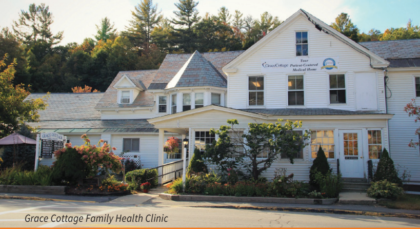
Grace Cottage Family Health Clinic