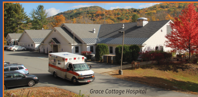
Grace Cottage Hospital