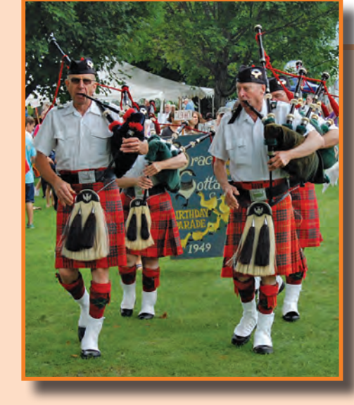
Bagpipers lead the Birthday Parade.