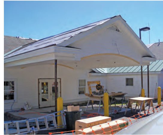
A beautiful new front entrance is rapidly taking shape at Grace Cottage.

Meanwhile, construction of a new roof over the hospital (including R57 insulation) is proceeding and completion of this major project is expected by late fall.