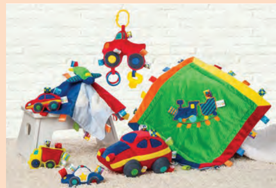
Baby Boy Gift Collection donated by Mary Meyer Toys.

Byrne Art Glass, Halladays Harvest Barn, Blake Hill Farms, and many more!