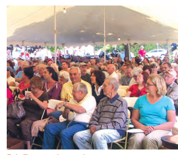
Fair Day auction action.