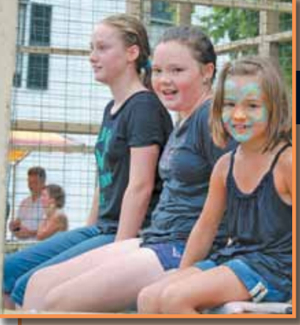
Three Fairgoers in the Dunking Booth were in the water a moment later!

The high bidder who got these signs at the Fair Day Auction may have used them after Hurricane Irene.