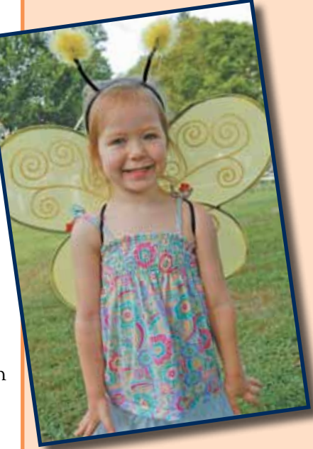
This butterfly looked ready to fly.