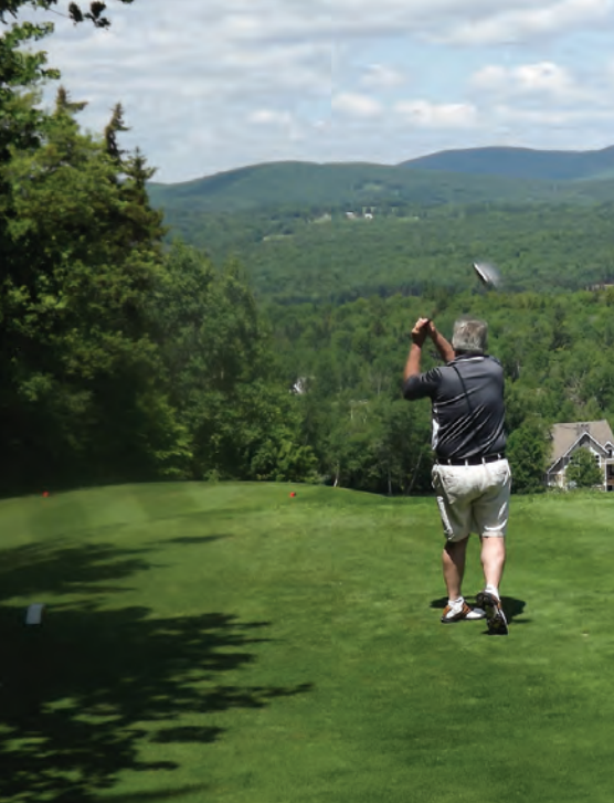
120 golfers participated in the sixth annual Tee It Up for Health on a glorious day in June at the Hermitage Club last year.

GRACE COTTAGE's seventh annual Tee It Up for Health , sponsored by The Richards Group and The Hermitage Club at Haystack Mountain, will be held on Saturday, June 11, at The Hermitage Golf Club in Wilmington, VT. Tee off time will be 1 p.m. Registration, which includes greens fees, cart, lunch (at noon), dinner, logo-wear, golf balls, and contests, is $150. All proceeds benefit Grace Cottage's Patient Care Fund. Go to www.gracecottage.org/events for more information and to register. Registration will close on Sunday, June 5, and will be limited to the first 128 golfers who sign up. If you don't have a team, we'll match you up! Last year's event raised almost $25,000, and a wonderful time was had by all thanks to sponsors, golfers, club staff, and volunteers.