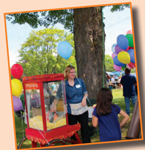
Fair Day balloons and popcorn!