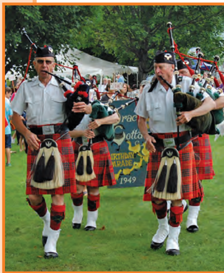
Bagpipers lead the Birthday Parade.