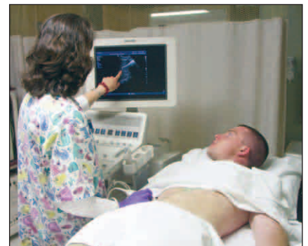
Grace Cottage's new ultrasound in use.

The wireless telemetry system enables patients' heart rhythms to be monitored at the nurses' station, so that any changes are immediately known.