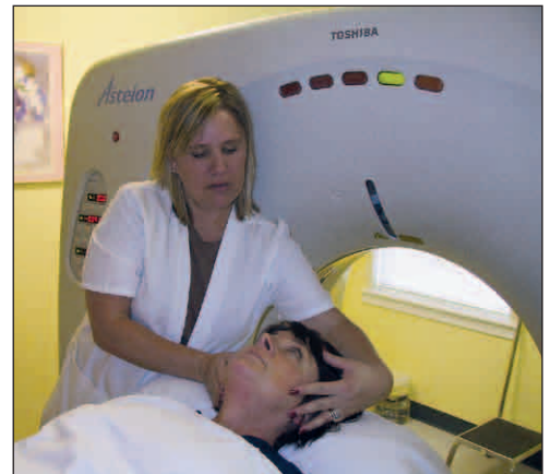
Grace Cottage's CT scanner enables physicians to work with radiologists for quick patient diagnosis.