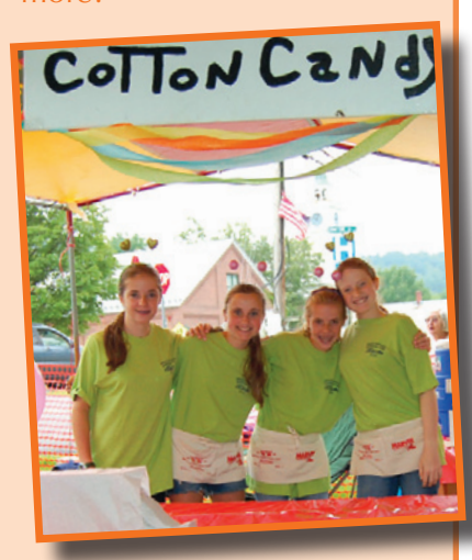
The Cotton Candy girls always have fun and decorate their booth beautifully.

Homemade ice cream, maple cotton candy, balloons, face painting....who could ask for more?