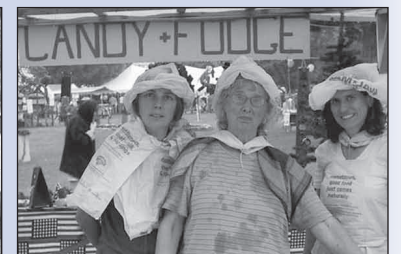
The latest fashion in rainwear -- another way to recycle those bags!