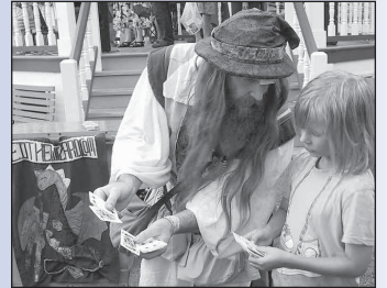
Look closely - where's your card?