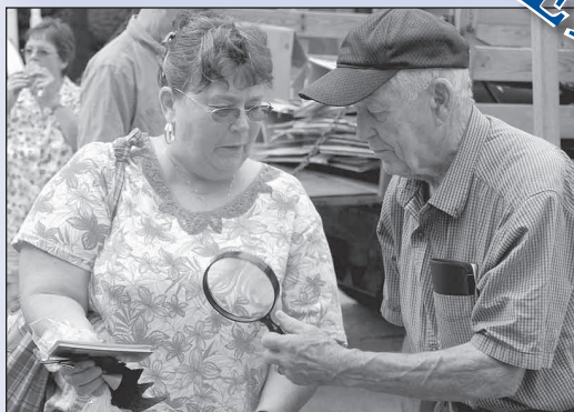
"What do you think? It's only $2."