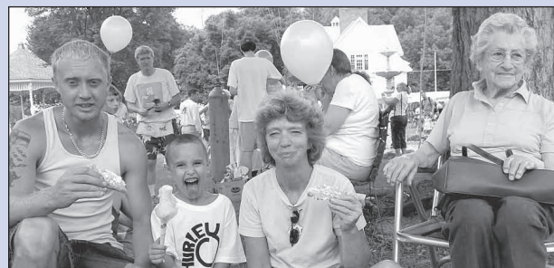
An "honorary grandma" made for a four-generation photo!