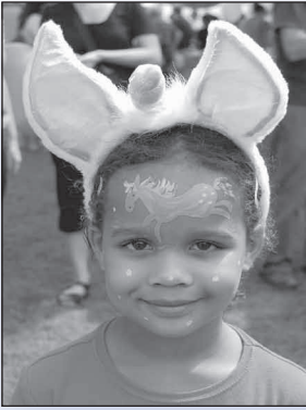
Costume Booth Cutie!