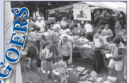
Bargain book lovers' heaven!